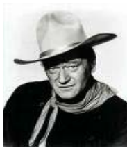
A. John Wayne