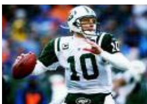
A. Chad Pennington