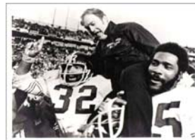
C. Chuck Noll