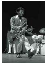
B. Chuck Berry