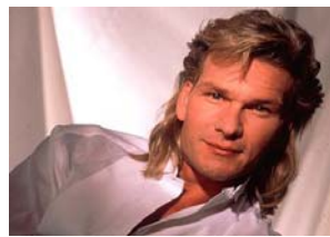
C. Patrick Swayze