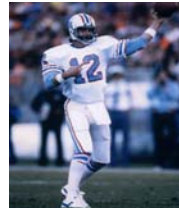
C. Ken Stabler