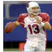
D. Kurt Warner

Correct Answer: A - Bart Starr. All four QBs are Super Bowl winners and legends, but only Bart Starr accomplished the holy grail: winning for just one head coach. The gritty Starr looked Lisle Blackbourn, Ray McLean, Phil Bengston, and Dan Devine straight in the eye and said, "Look chump, I win for one coach and one coach only: Lombardi." That's why he's CHFF's number one quarterback of all time.