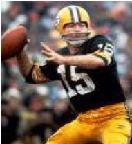
A. Bart Starr