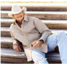
A.. Alan Jackson