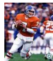
D. John Elway

Correct answer: A - Pennington. Sorry Favre (4-3 vs. Patriots, including Super Bowl), sorry Fiedler (4-5 vs. Patriots), sorry Elway (11-0 vs. Patriots), your starting records aren't quite bad enough. Only Pennington, 3-7 career starting vs. New England, qualifies for the honor of being singled out by Cold, Hard Football Facts as having played "historically well" against New England. Now that's what MVPs are made of! Patriots cornerbacks...don't say we didn't warn you.