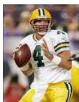
B. Brett Favre