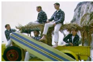
C. The Beach Boys