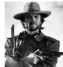
D. Clint Eastwood

Correct answer: C - Swayze. All four are successful hollywood stars, but what separates Swayze from The Duke's rugged masculinity, Bronson's tough guy looks, and Eastwood's morally ambiguous anti-hero are his skills as an accomplished dancer and his romantic lead chops. Now that's a he-man. Only a trained eye can spot the difference.