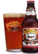
C. Sierra Nevada