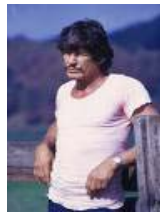
B. Charles Bronson