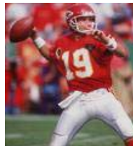
B. Joe Montana