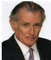
B. Frank Deford